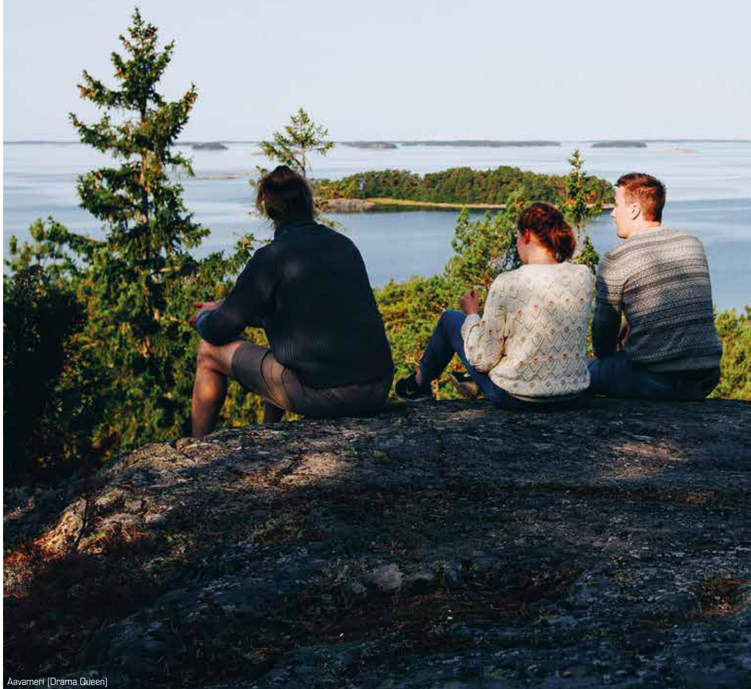
Aavameri (Drama Queen)