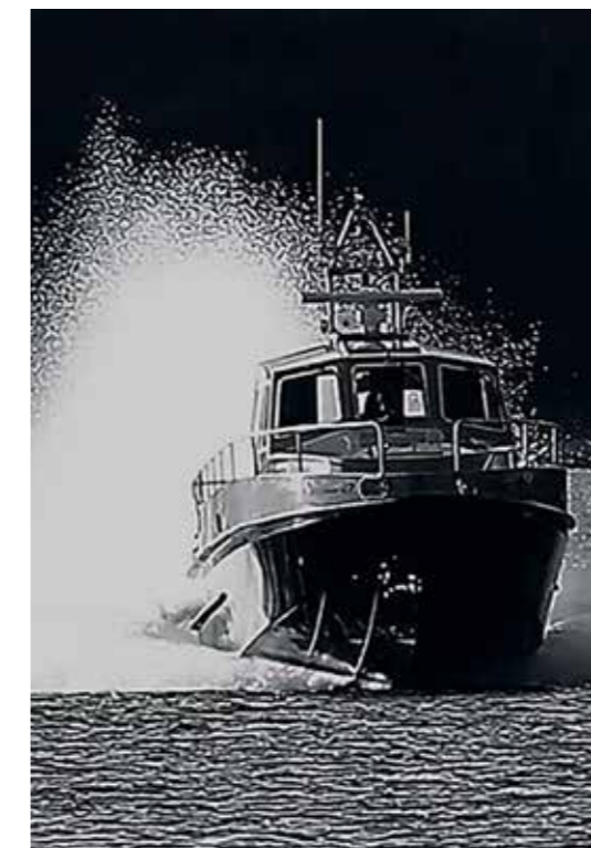
VisitArchiipelago.com / Ellen Sundström